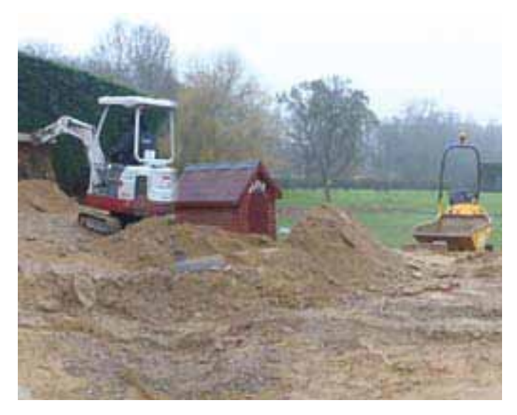
The former swimming pool was transformed into a raised vegetable terrace.

Our belief in developing a long term relationship with garden and client served us well, for Jos' original concept drawings have developed and evolved over nearly 12 months, whilst we transformed the large estate.