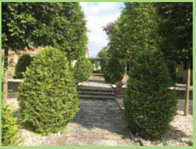
Carpinus 'Frans Fontaine' and Thuja pliccata thriving 10 years after planting.